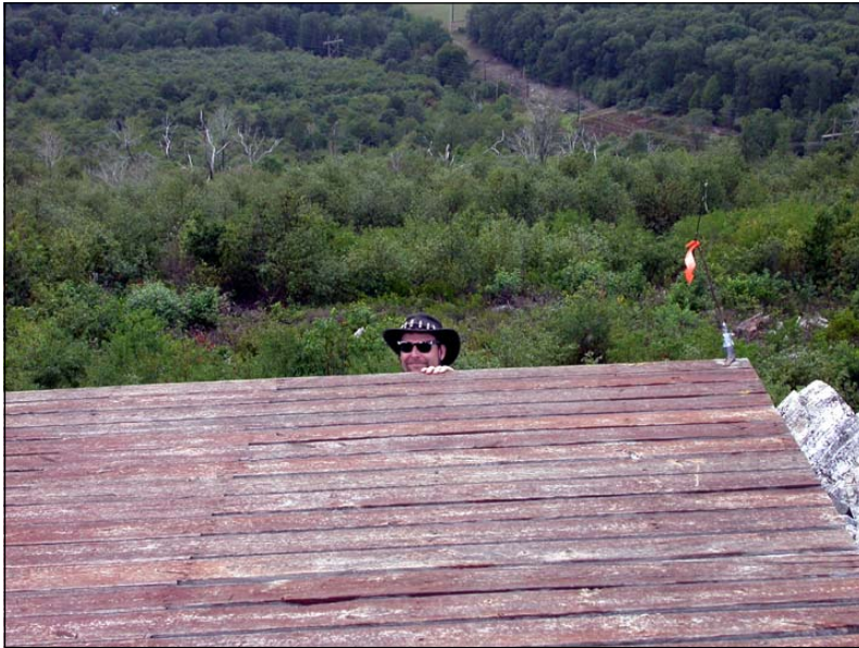
Fly safely - the Flight Director is watching you! (And he could be anywhere...)