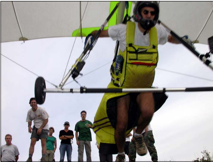
The author in the middle of his take-off run.

munity] are truly fortunate to have two great flight parks conveniently nearby ( and to be honest, nobody can party like these flight park crews can after the sun goes down ), but my first love in hang gliding is - and always has been - foot launching, especially in the mountains. To me, there is something magical about running off into the wind, with my glider on my back; the glider lifts off my shoulders, and ceases to exist as a separate object. Instead, it feels like I truly have wings of my own... I continue to run, and the ground falls away beneath me, and I continue into the air; like a bird, I tuck my legs back behind me, leveling off in streamlined flight, and whether it is for a few minutes, or for an hour or more, I enjoy the sensation of pure flight, until I have no choice but to return to Mother Earth.